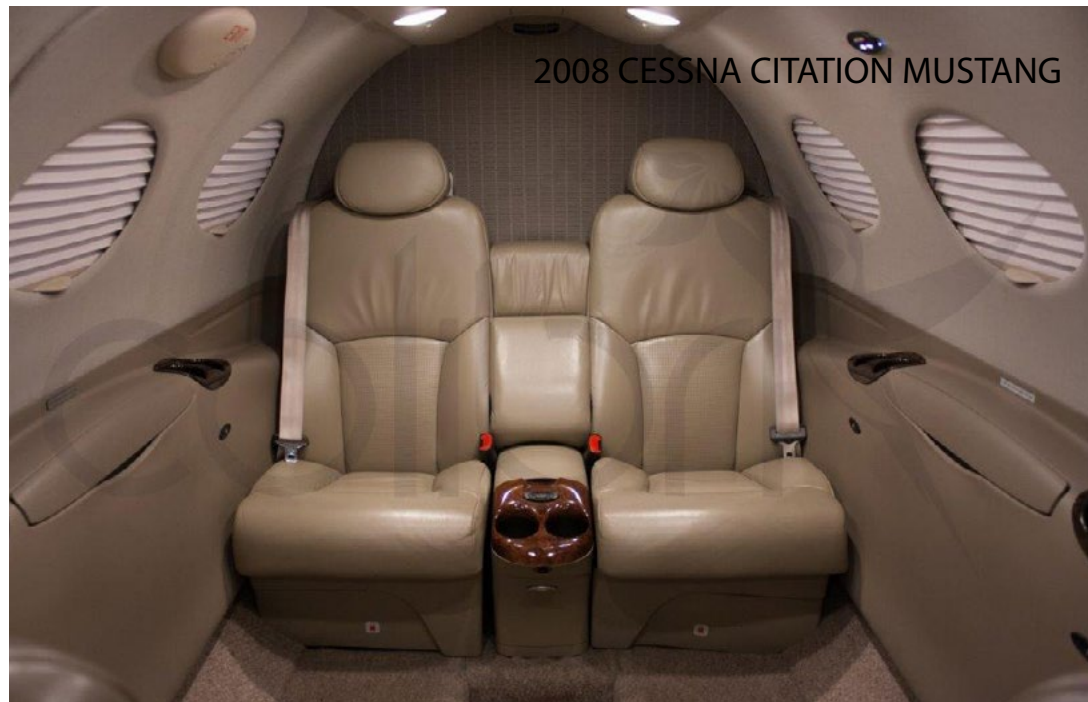
2008 CESSNA CITATION MUSTANG